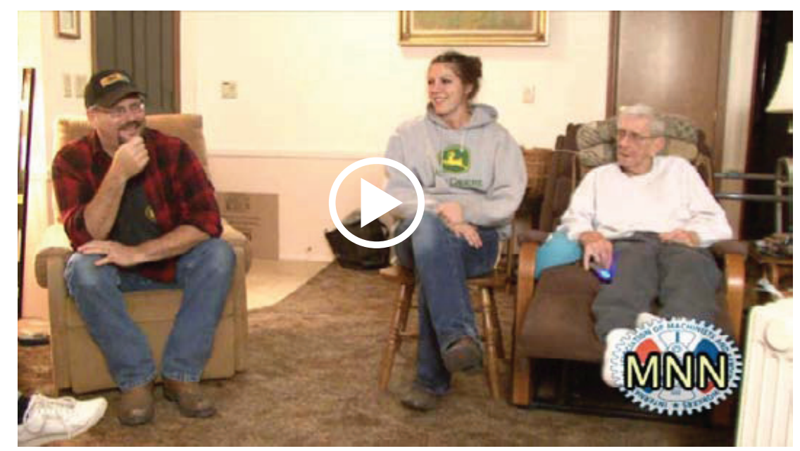
Click left to view a video about important working family programs that are threatened by the looming budget cuts in the wake of the Super Committee's failure to agree on deficit reduction.

"Cutting a trillion dollars from defense spending will kill over one million jobs."