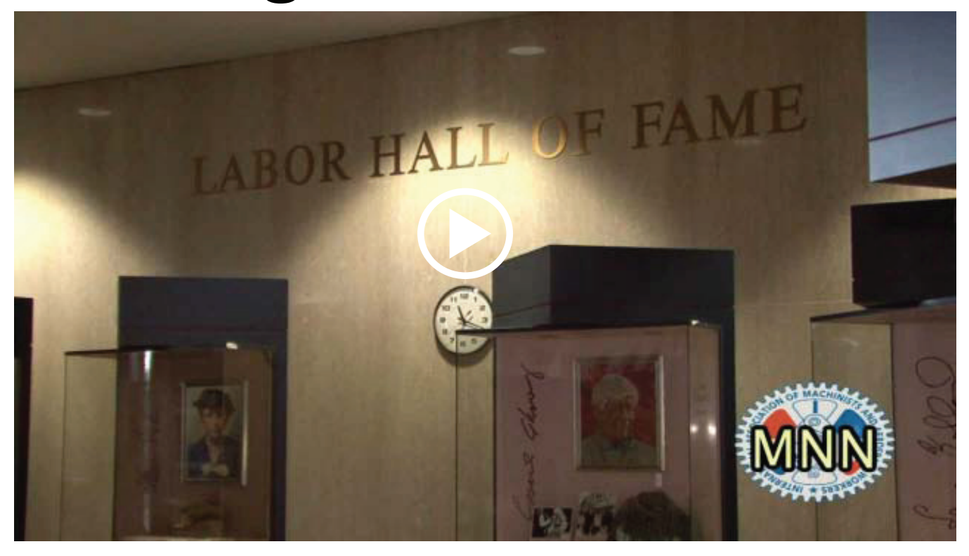
The Department of Labor's Hall of Fame honors men and women who fought for the rights of average Americans. Click above to view a video about the Labor Hall of Fame.

History focuses on the big names, but not the hard-working heroes who make life better for average families, except at the Labor Hall of Fame.