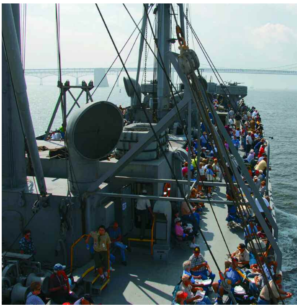
The John W. Brown is one of only two World War II Liberty ships still in operation. Named after Shipbuilding Workers' labor leader John W. Brown, the ship conducts several trips each year on Maryland's Chesapeake Bay to keep alive the legacy of those who built and those who sailed these historic ships.

The speed at which Liberty ships were built remains a testament to the motivation and productivity