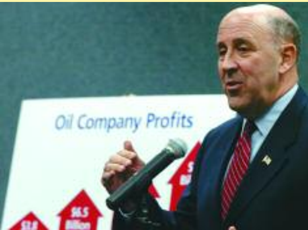
Wisconsin Governor Jim Doyle fought high gas prices that allowed oil companies to rack up record profits at the expense of American consumers.