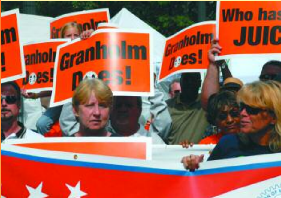
IAM members were out in force at the Detroit Labor Day parade, above, and union-sponsored Labor Day events in Pennsylvania, Connecticut, Ohio and Wisconsin to focus attention on key races for governors and other offices.

Strickland also differs from Blackwell on Social Security and Medicare. "I oppose all efforts to privatize Social Security," declared Strickland, who also co-sponsored legislation to protect retiree health benefits during corporate bankruptcy proceedings. "A secure retirement must be part of the American way. No longer can American workers lose their pensions because of this Administration's reckless outsourcing policies and huge tax breaks for the rich."