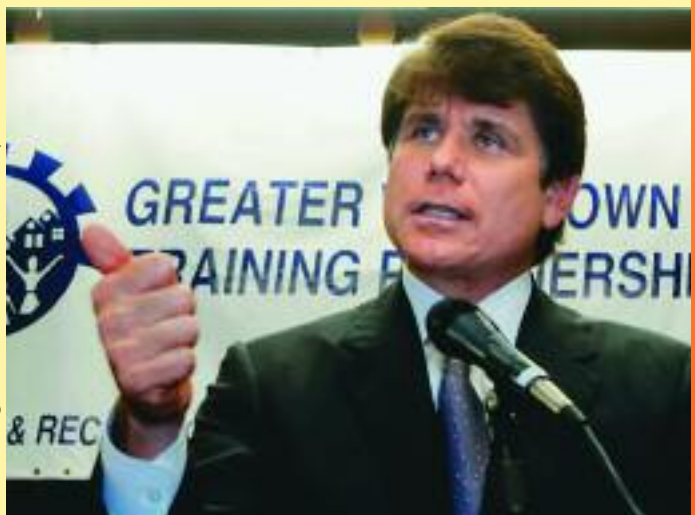
Illinois Governor Rod Blagojevich restored collective bargaining rights for state workers and created more jobs than any other Midwest state.