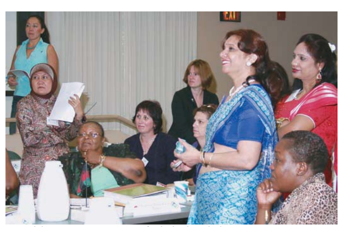
Building strong ties of global solidarity, women from 26 countries participated in the first International Federation of Transport Workers Women's Summer School hosted by the IAM's Winpisinger Education and Technology Center.

ITF is informing and advising unions about developments in the transport industry around the world. The ITF also organizes support efforts when transport unions in one country need assistance from unions in other countries.