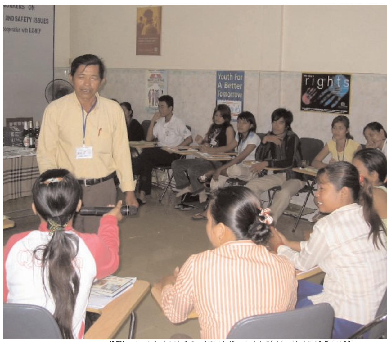
APHEDA organises role plays for training the "beer girls" to defend themselves better (this shot was taken in the ILO office). (→ S.G.)

Over 20,000 women in Cambodia are paid to dress in the colours of one beer brand or another to draw in customers and encourage them to drink. Sexual harassed, insulted and assaulted by inebriated customers, some are now looking to trade unions for defence.