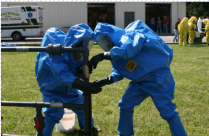
Left--Fix that leak: it's no easy job to do when confined in the protective suit and carrying the weight of the respirator.