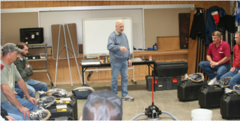
Instructor gets started by describing the purposes of the gear sitting in front of each participant.