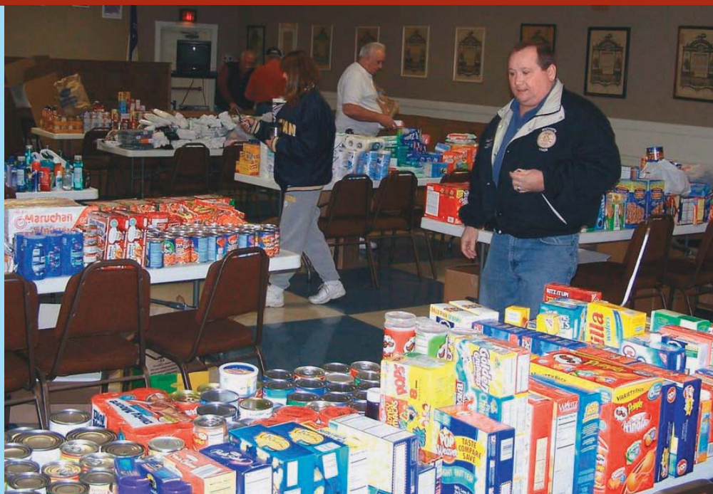
Volunteers from IAM District 34 in Columbus, OH prepare more than 3,000 pounds of donated goods for shipment to military personnel serving in Iraq.