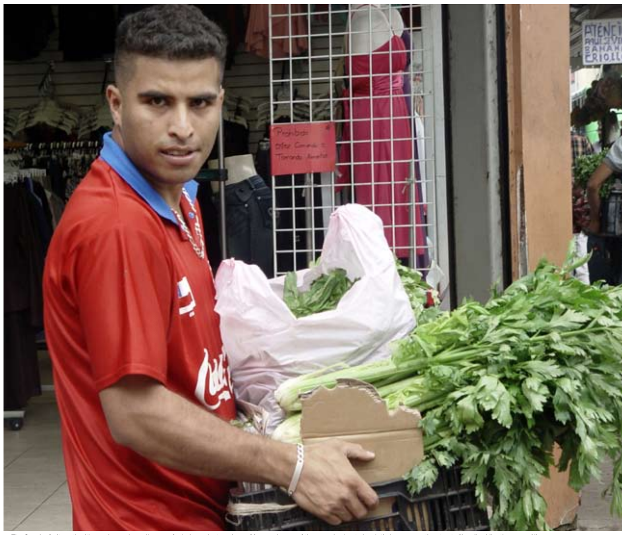
The San José city authorities no longer issue licences for independent workers. More and more of them are having to hawk their wares on the streets illegally. Like the young Nicaraguan who, when he sees the police coming, quickly gathers up his goods and runs off to sell his vegetables elsewhere.

Health insurance, child care, cooperatives, administrative and legal assistance, housing...the CMTC has developed an attractive range of services to support the trade union organising of informal economy workers, many of whom are migrants.