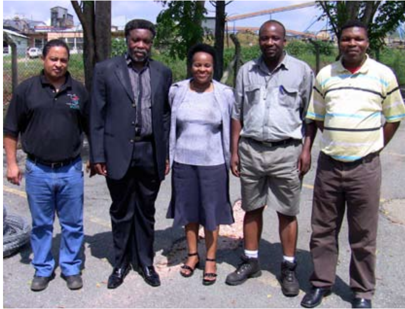
The trade union delegation reports ever-greater pressure on workers at the mill in Bhunya.

The key sugar industry, which accounts for 18 percent of national output and employs over one-third of all agricultural workers in Swaziland, has also seen thousands of job losses, with more feared as the European Union prepares to cut preferential prices to comply with World Trade Organization rules.