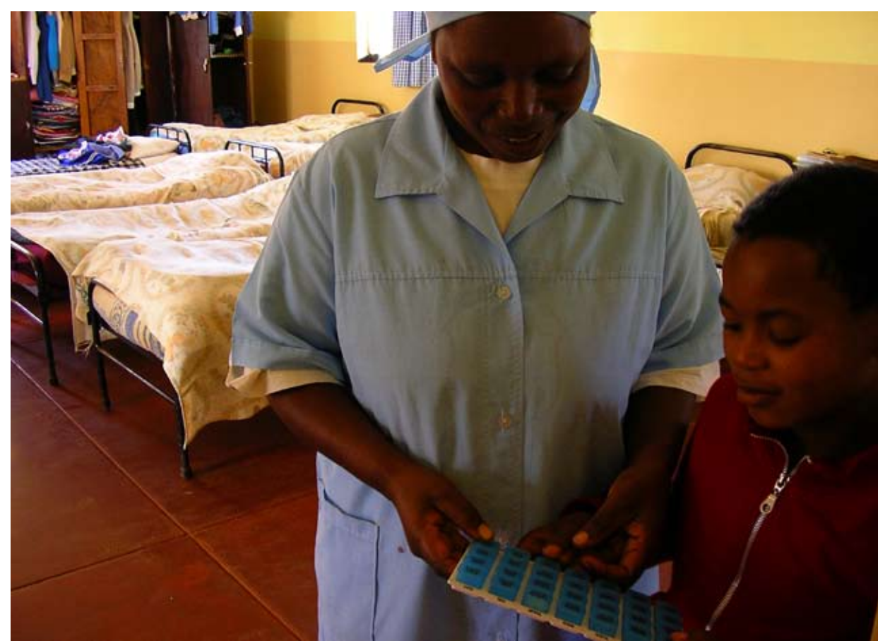
→ Delayed Gratification

leading to undernourishment, which hinders the prospects of a healthy existence for those living with AIDS, even if they have access to antiretroviral treatment.