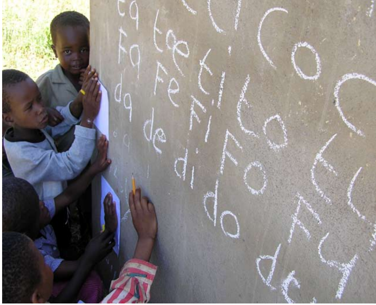
→ Delayed Gratification

The problem is compounded by the relentless spread of AIDS, which has devastated a generation of Swazis since the 1980s. UNICEF estimates there are 100,000 orphans in this nation of just over one million. More and more kids are forced to stay at home either because they are too sick to make the journey to class or because the loss of the parents means they have to care for younger brothers or sisters.