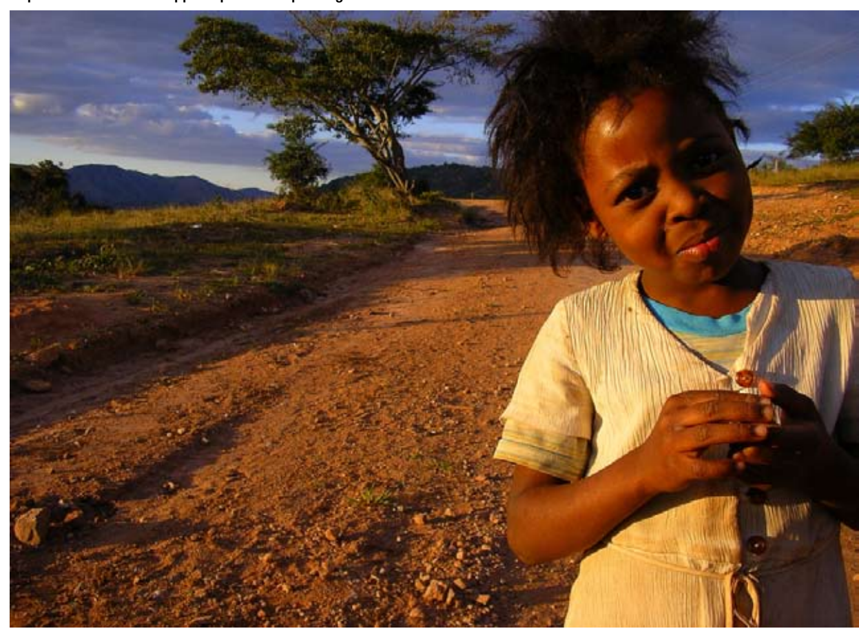
The extravagant spending of the royal family and its entourage together with the overblown military budget stand in stark contrast to the dire under-funding of the health and education sectors. Delayed Gratification

Repression has been stepped up with the passing of the new anti-terrorism law.