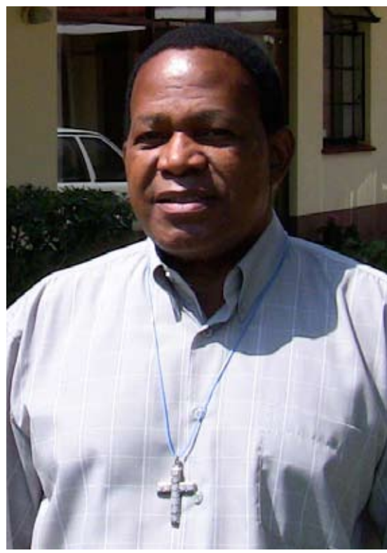
"This is a very small and vulnerable economy ... the strongest weapon is isolation and economic pressure," Meshack Mabuza, Anglican Bishop of Swaziland. →Paul Ames

of the king's brothers. The eviction was carried out despite a ruling against it from the Supreme Court.