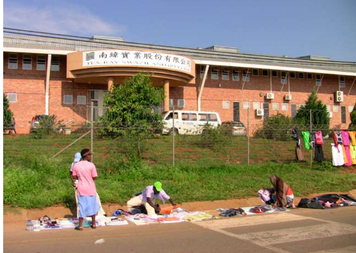
The global economic slowdown has also raised fears over the plight of the textile industry in the months to come. →Paul Ames

In 2008, one of the biggest strikes in the country's history was brutally suppressed.