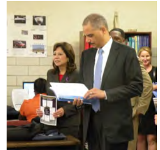
Secretary of Labor Hilda Solis, Attorney General Eric Holder