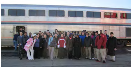
Group photo at Winona Station