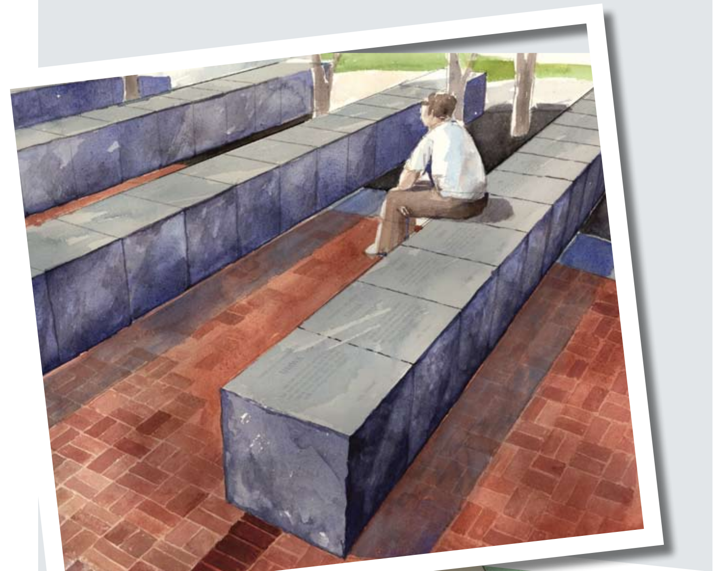
Above: Artist's rendering of granite benches at the National Workers Memorial