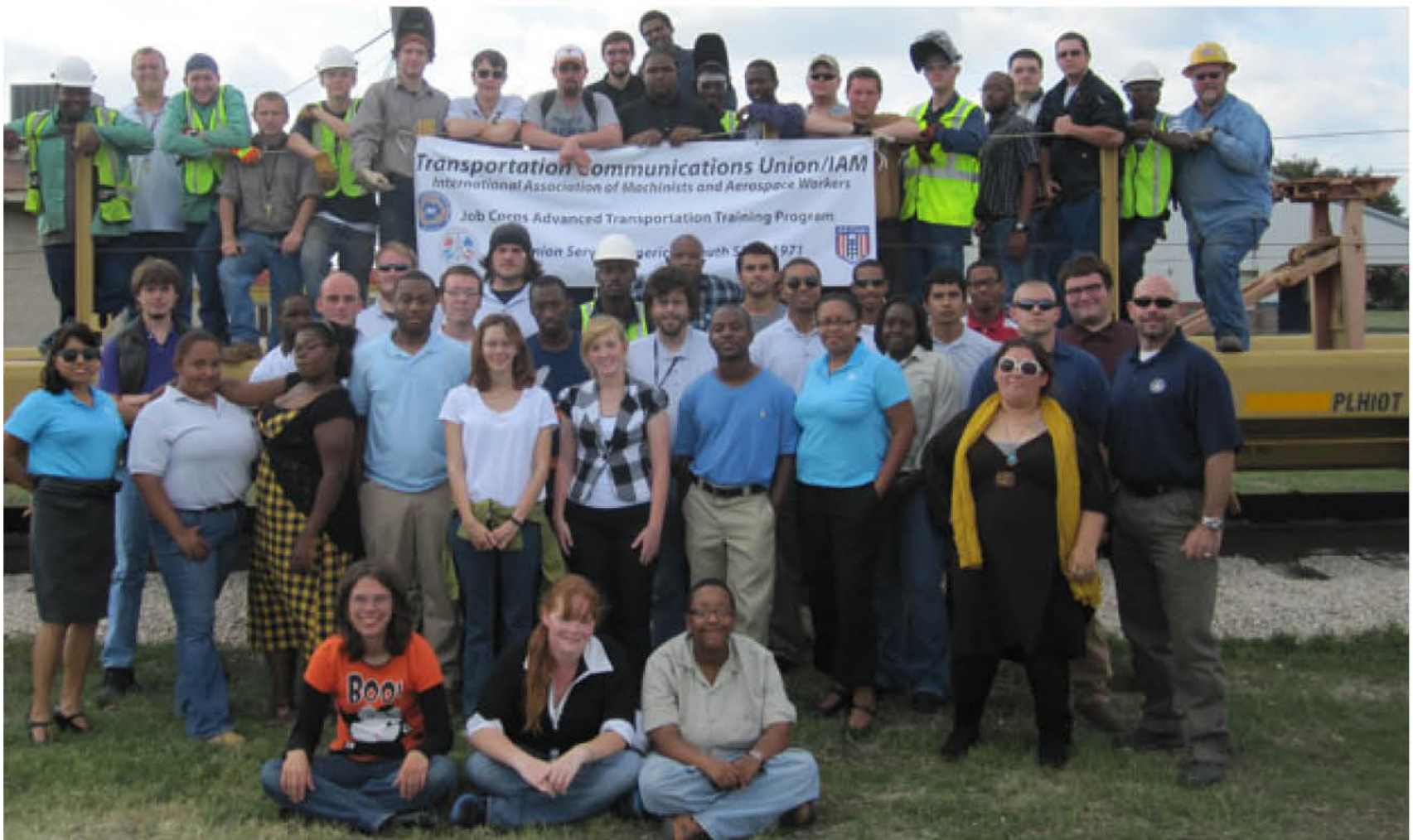
Instructors and students from the TCU/IAM Training Services Center in San Marcos, Texas with the newly-installed TTX railcar.

Train coupler assembly and repair will be taught on the railcar, and every