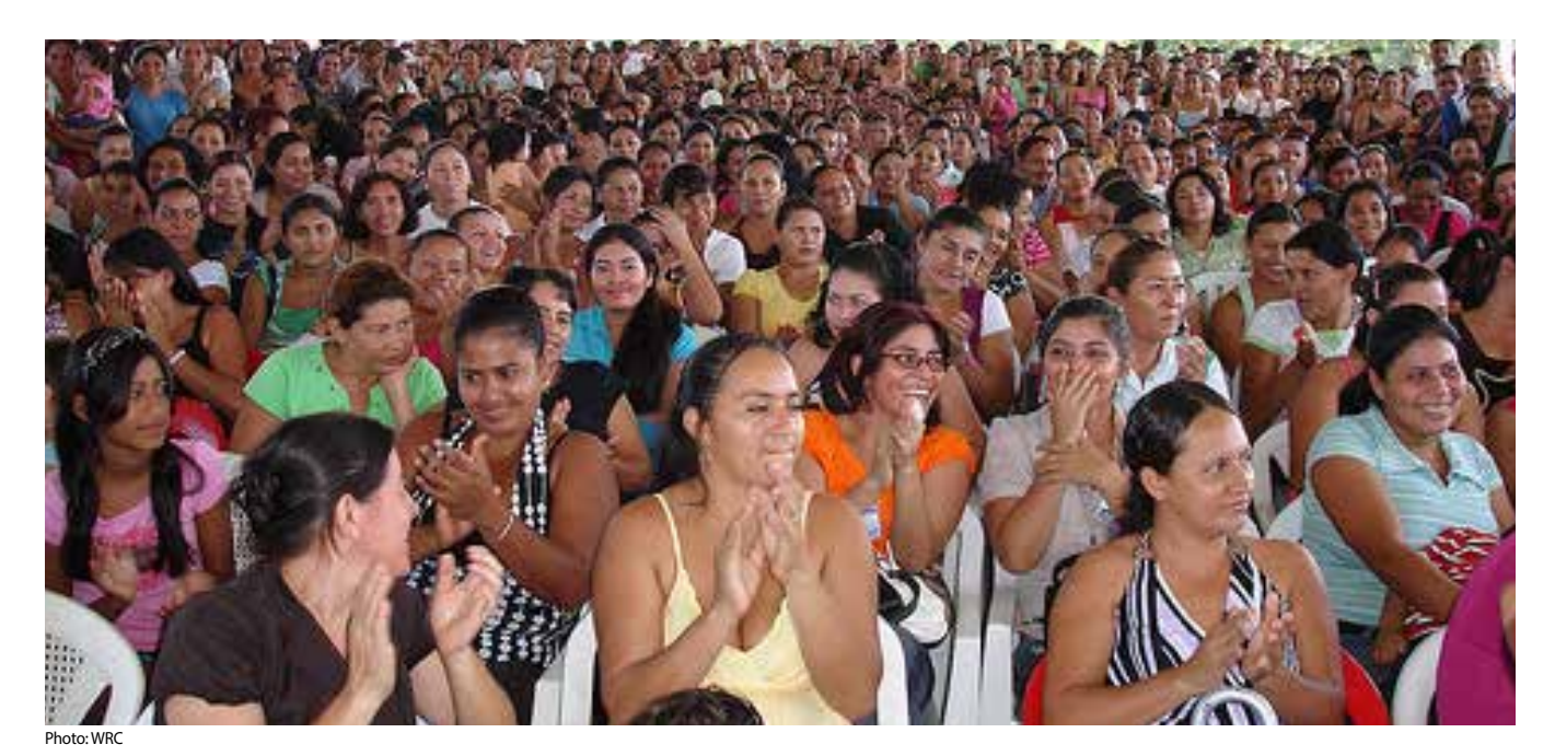
RESPONSIBILITY OUTSOURCED: SOCIAL AUDITS, WORKPLACE CERTIFICATION AND TWENTY YEARS OF FAILURE TO PROTECT WORKER RIGHTS

Ignoring the FLA's defense of Russell's closure decision, numerous universities ultimately chose to strip Russell of its licensing rights; eventually, more than 100 universities took this action. The pressure brought Russell to the negotiating table with the CGT in October 2009. The local union and national CGT signed a groundbreaking labor rights agreement with the employer. Russell agreed to reopen the factory under a new name, rehire all of the