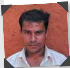
Bide Majkoti Labourer