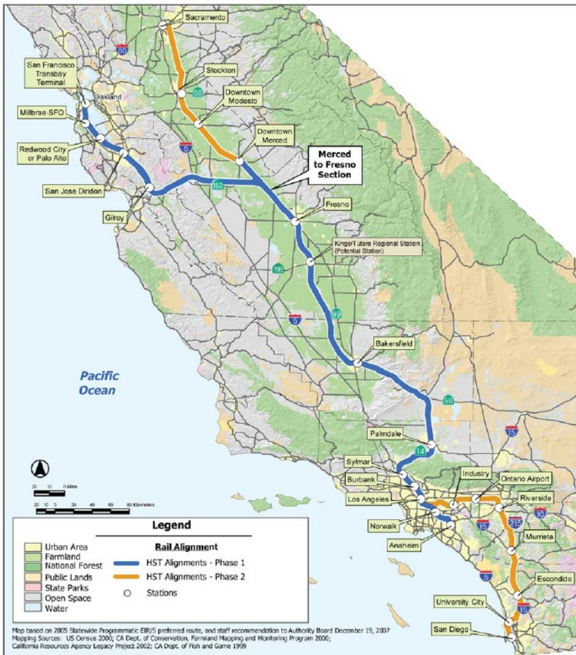
Figure 1 California HST System Initial Study Corridors