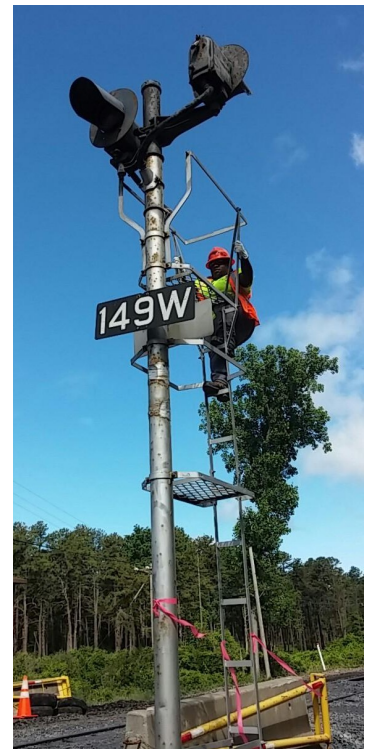
Shriver graduate, Tamika, climbing rail signal