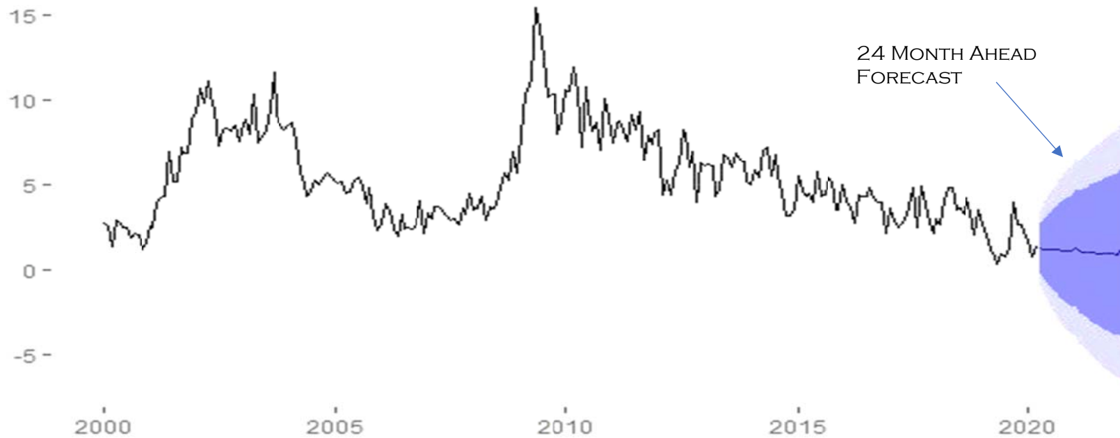
FIGURE 4 COMPUTER AND ELECTRONIC PRODUCTS UNEMPLOYMENT RATES JANUARY 2000 - MARCH 2020 AND 24 MONTH AHEAD FORECAST

UNEMPLOYMENT RATE FROM JAN 2000 – MARCH 2020