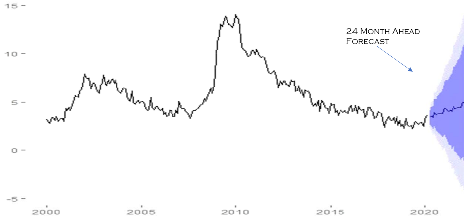
FIGURE 2 DURABLE GOODS MANUFACTURING UNEMPLOYMENT RATE AND 24 MONTH AHEAD FORECAST

UNEMPLOYMENT RATE FROM JAN 2000 – MARCH 2020