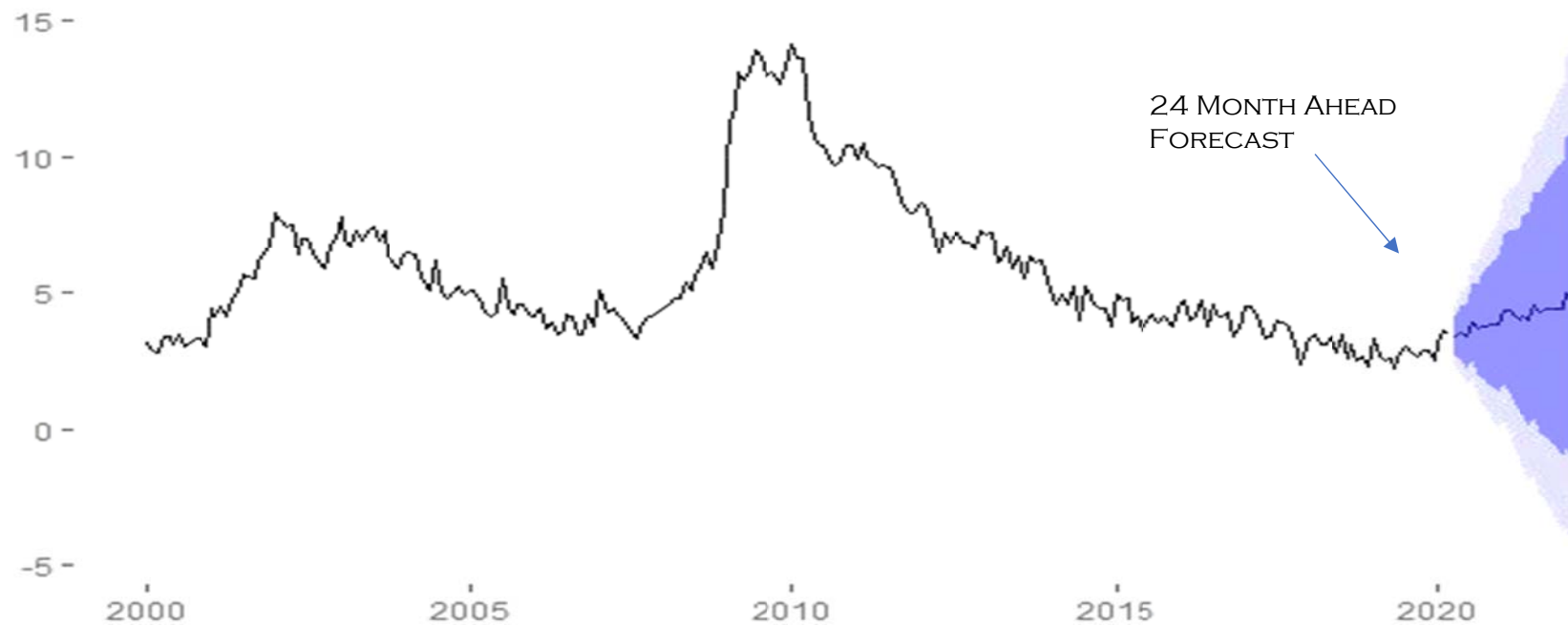
FIGURE 3 NON-DURABLE MANUFACTURING UNEMPLOYMENT RATE AND 24 MONTH AHEAD FORECAST

UNEMPLOYMENT RATE FROM JAN 2000 – MARCH 2020