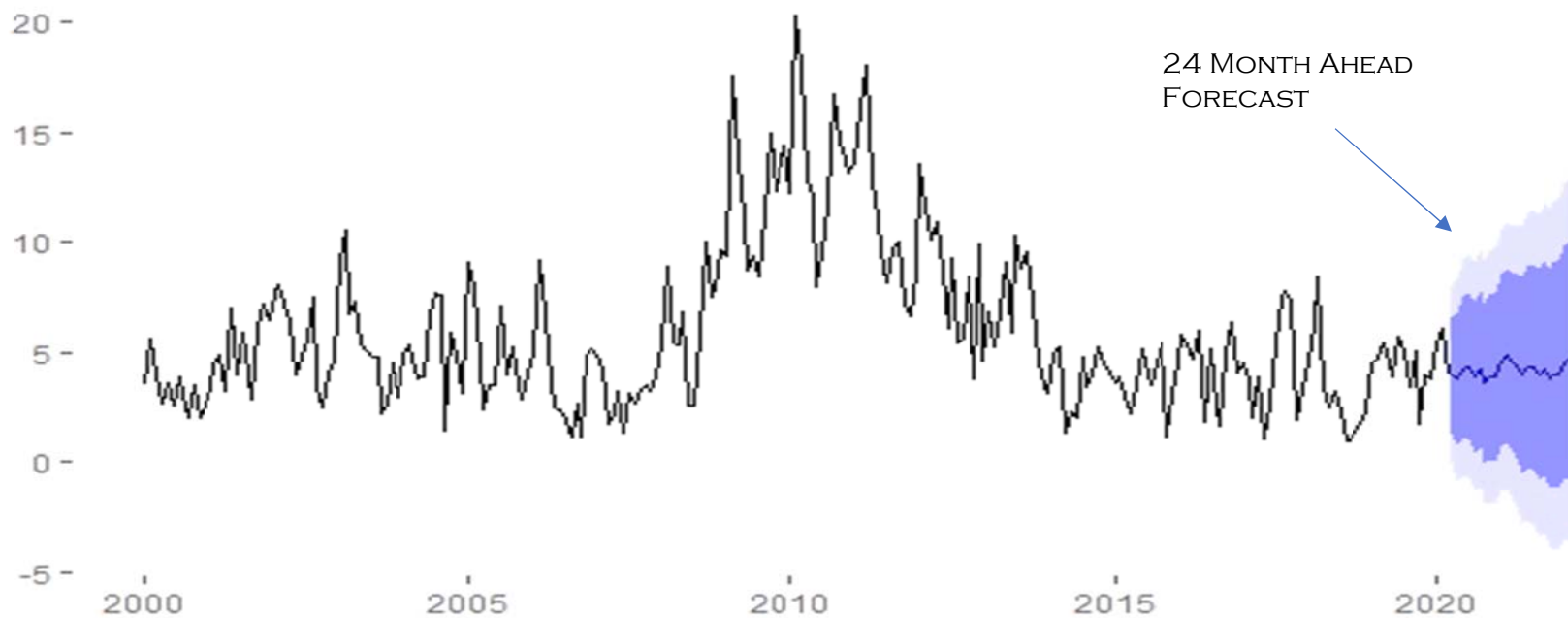
FIGURE 1 1 NONMETALLIC MINERAL PRODUCT MANUFACTURING UNEMPLOYMENT RATE AND 24 MONTH AHEAD FORECAST

UNEMPLOYMENT RATE FROM JAN 2000 – MARCH 2020