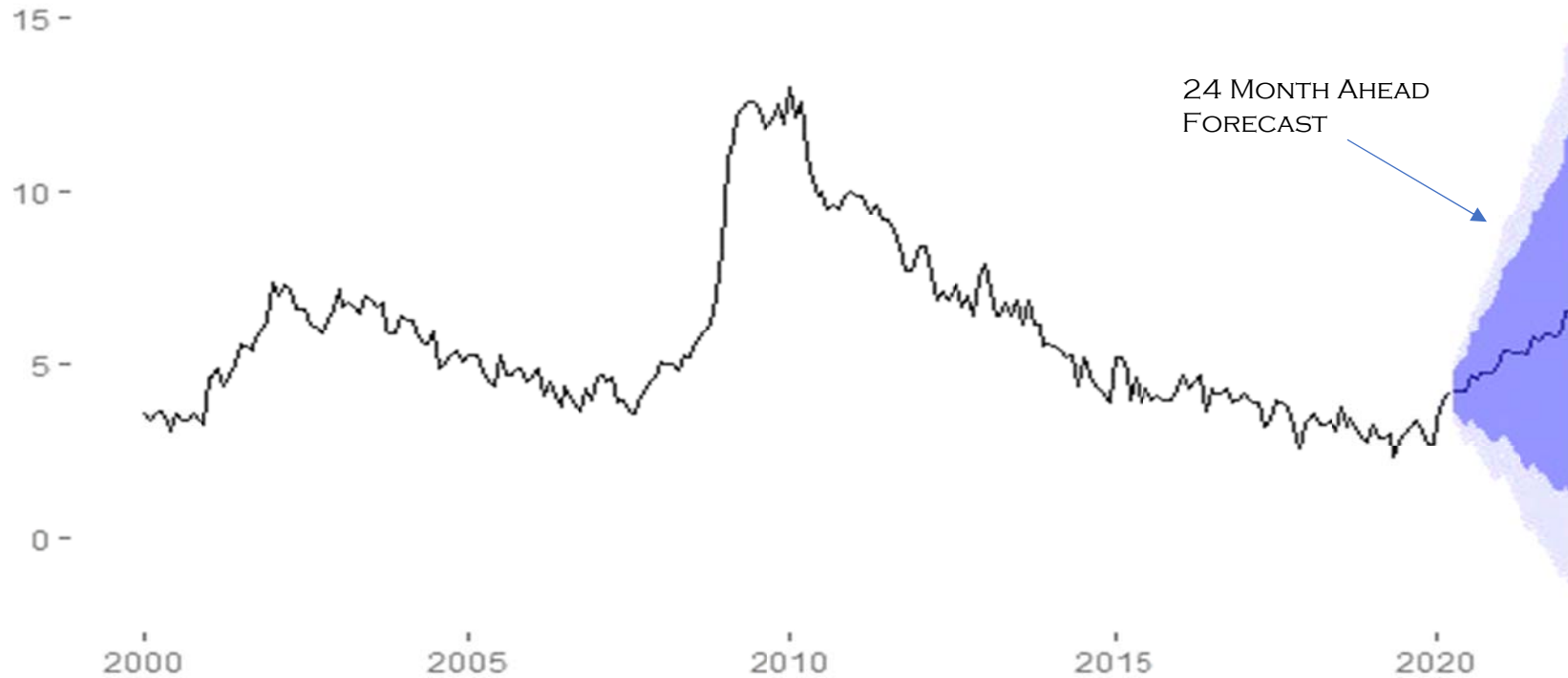
FIGURE 1 MANUFACTURING UNEMPLOYMENT RATE, JANUARY 2000 - MARCH 2020 AND 24 MONTH AHEAD FORECAST

UNEMPLOYMENT RATE FROM JAN 2000 – MARCH 2020