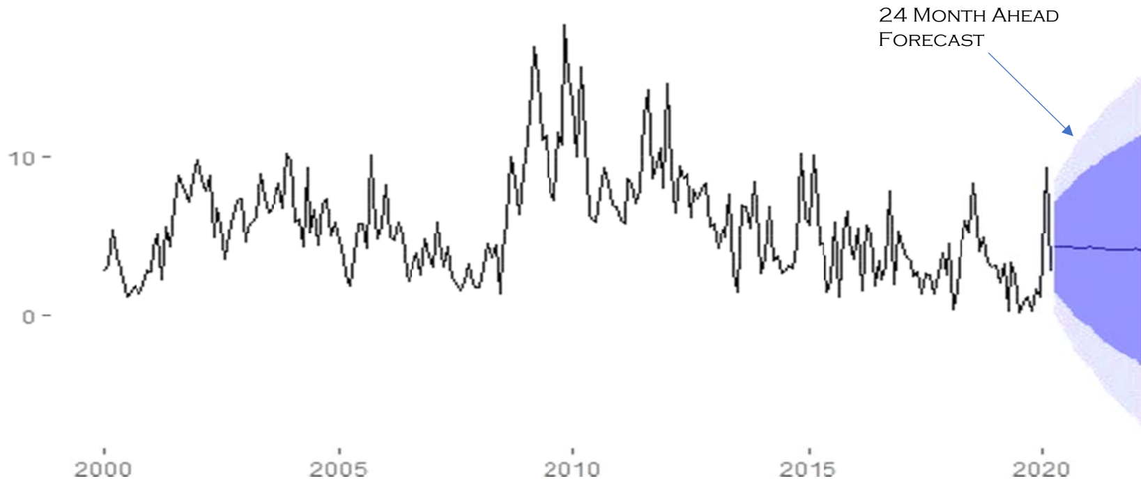
FIGURE 5 ELECTRICAL EQUIPMENT APPLIANCES UNEMPLOYMENT RATE, JAN 2000 - MARCH 2020 AND 24 MONTH AHEAD FORECAST

UNEMPLOYMENT RATE FROM JAN 2000 – MARCH 2020