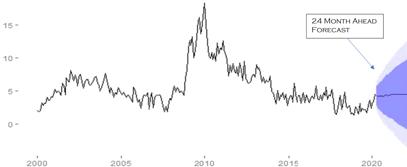
FIGURE 7 PRIMARY AND FABRICATED METALS UNEMPLOYMENT RATES, JANUARY 2000 - MARCH 2020, AND 24 MONTH AHEAD FORECAST

UNEMPLOYMENT RATE FROM JAN 2000 – MARCH 2020