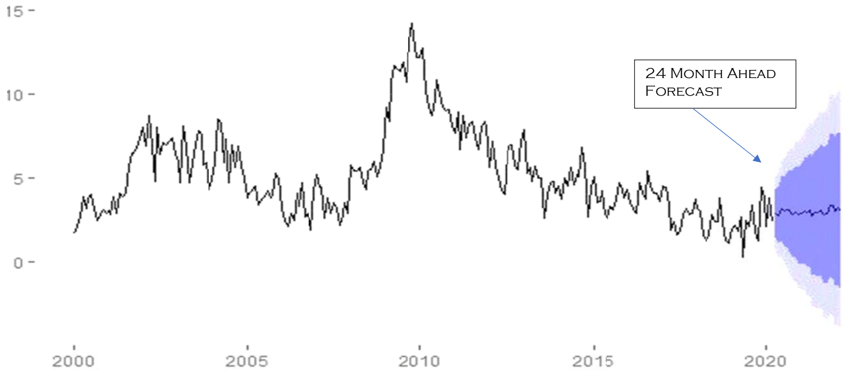
FIGURE 6 MACHINERY UNEMPLOYMENT RATE, JANUARY 2000 - MARCH 2020, AND 24 MONTH AHEAD FORECAST