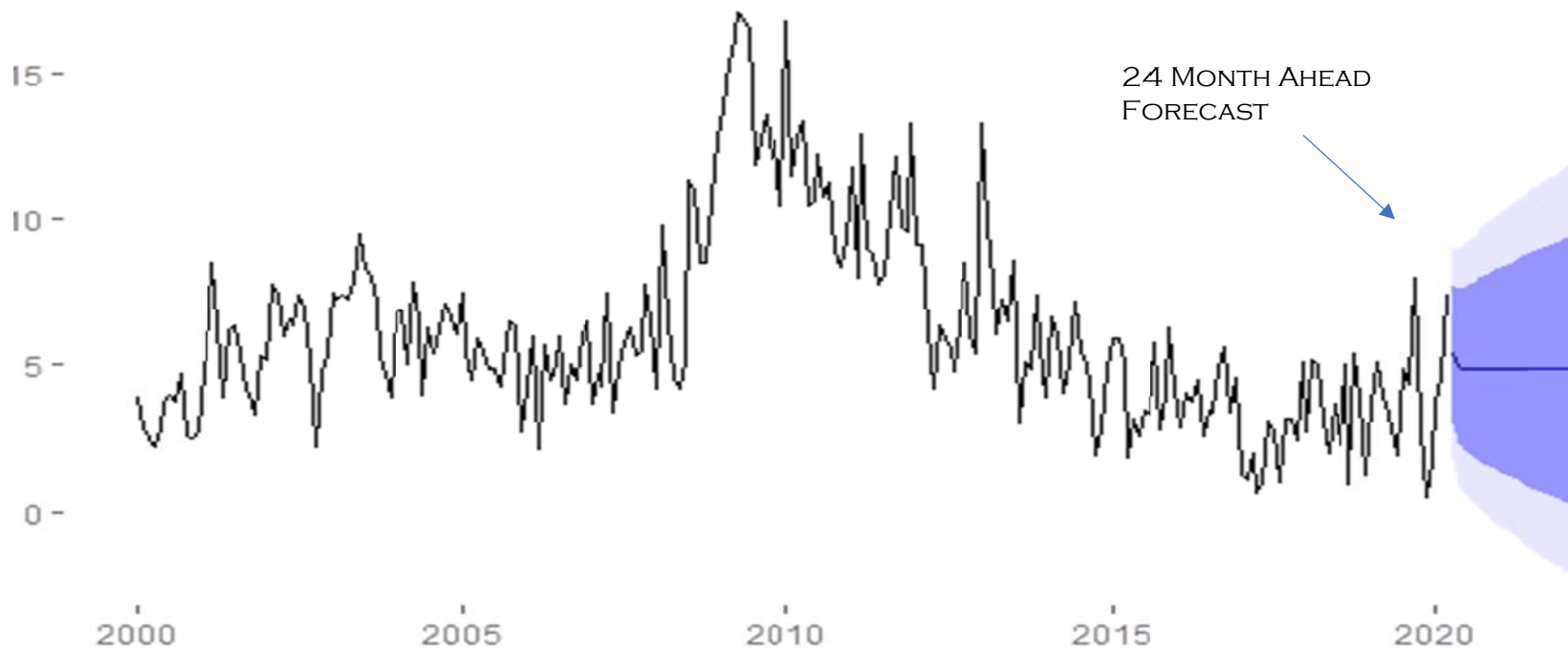
FIGURE 10 PLASTICS AND RUBBER PRODUCTS MANUFACTURING UNEMPLOYMENT RATES JANUARY 2000 – MARCH 2020 AND 24 MONTH FORECAST

UNEMPLOYMENT RATE FROM JAN 2000 – MARCH 2020