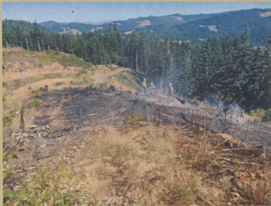
An abandoned campfire on Aug. 1 in Douglas County burned one-half acre and cost more than $12,000 to put out.

The 2016 fire season was off to a promising start. Following three consecutive prolific fire seasons, the Oregon Department of Forestry had early success. But as always, there is room for improvement. As of mid-August, 470 wildfires have burned 2,685 acres on ODF-protected land. Acres burned at this time each of the last three years accounted for 93,613 (2013), 46,583 (2014) and 17,800 (2015) respectively.