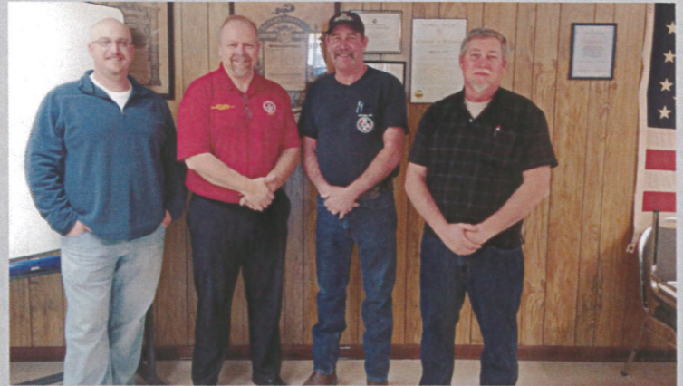
Local Lodge 1106 Negotiation Committee left to right:

The Committee worked hard and was dedicated in trying to improve the lives of their members and their families.