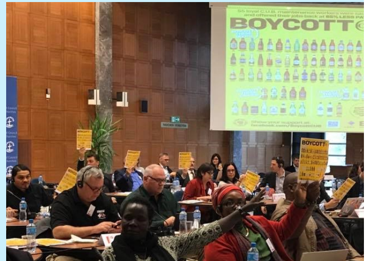
BWI World Board Meeting in session in Geneva, Switzerland.