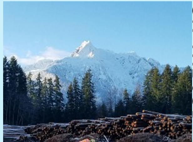
Weyerhaeuser log yard in The Cascades.

BEST WISHES FROM THE WOODWORKERS DEPARTMENT FOR A SAFE HOLIDAY AND HAPPY and HEALTHY NEW YEAR!