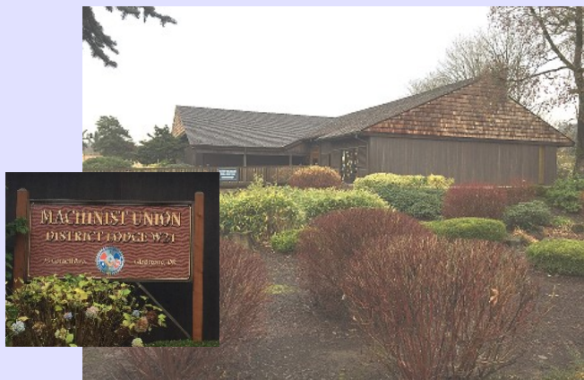
District Lodge W24 in Gladstone, Oregon