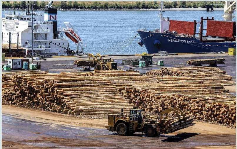
Weyerhaeuser—Longview Export Facility