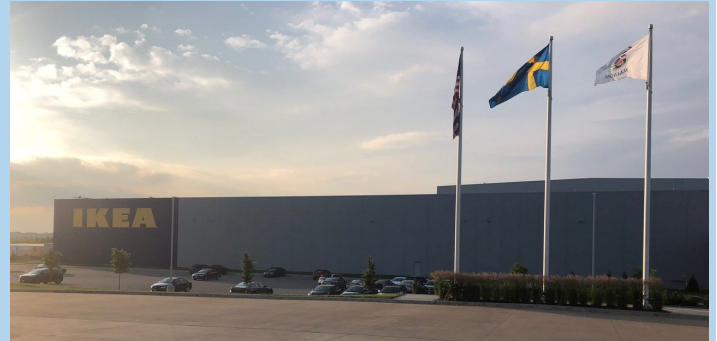
Pictured below: IKEA Distribution Center in Minooka