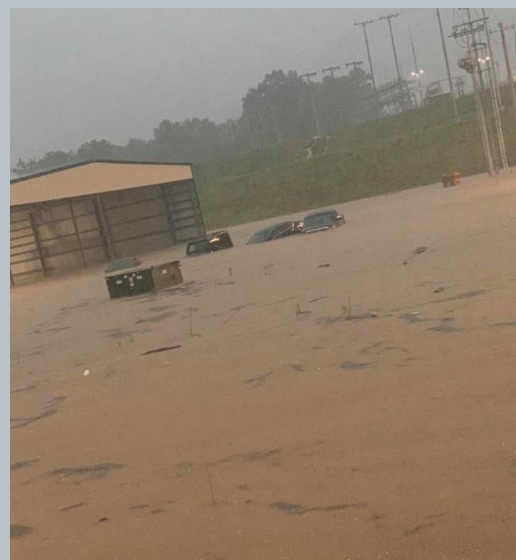
Pictured above: Summer 2019 Arkansas flood Dierks, Arkansas, Weyerhaeuser lumberyard