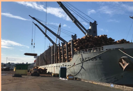
Local Lodge W130 represented at Port of Olympia Export Facility

Respondents were more likely to approve of unions if they were in a union household or lean left politically: 86% of U.S. adults living in a household with a union member approve of unions, compared with 60% of those in nonunion households, and Democrats (82%) remained far more likely than Republicans (45%) to approve of unions.