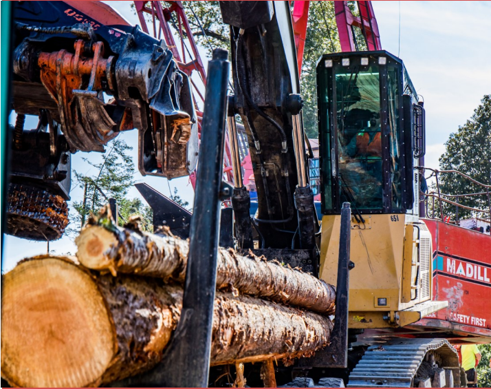
Green Diamond Resources, Arcata, CA

Published by: IAM Woodworkers Department 9000 Machinists Place Upper Marlboro, MD 301-967-4555 ; fax 301-967-4763