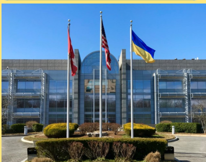
In solidarity, the Ukraine flag flies along-side of the American and Canadian flags in front of the IAM Grand Lodge in Upper Marlboro, MD.

“We are trying to support our members in complicated circumstances, especially those who are at the border line in eastern Ukraine. The situation is very tense. People are afraid of the war escalating which also means economic downturn and jobs vanishing, especially in construction. It will take enormous efforts and time from us. But there is no other option or chance for workers to survive in this turmoil.”