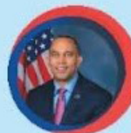
Rep. Hakeem Jeffries (NY) - invited House Democratic Leader