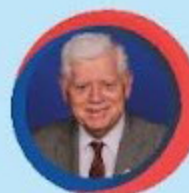
Rep. John Larson (CT) House Committee on Ways and Means Social Security Subcommittee Ranking Member