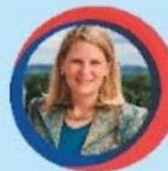
Liz Shuler - invited AFL-CIO President