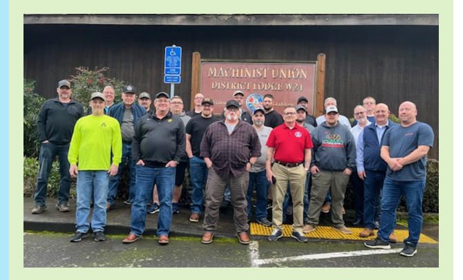
EDUCATION, Continued on Page 3

Pictured below: The participants of the 2nd Woodworkers Field Training Program.