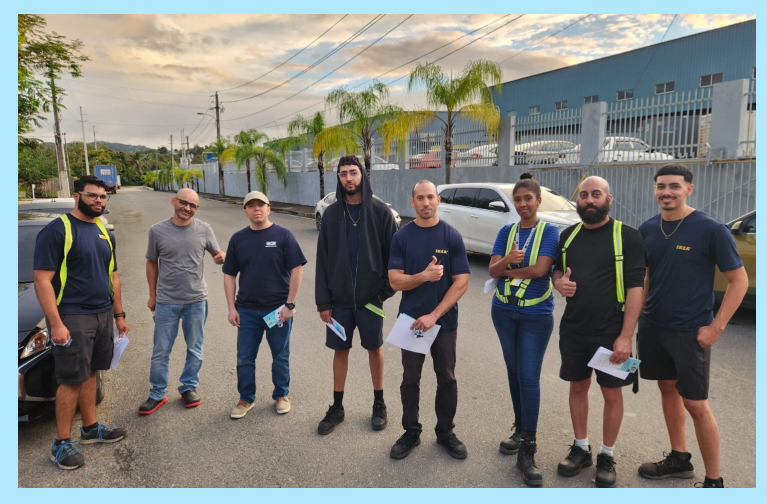
Pictured above: A happy group of the newest of 51 IKEA members in Puerto Rico that have voted to join the Machinists Union.

A group of 51 IKEA warehouse workers in Carolina, Puerto Rico voted overwhelmingly on Tuesday, February 20th to join the International Association of Machinists and Aerospace Workers (IAM).